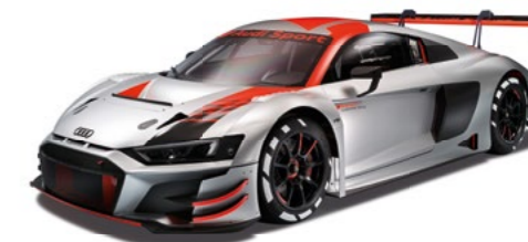
INTERCONTINENTAL GT CHALLENGE Round 2 California 8 Hours (USA) March 28-30, 2019