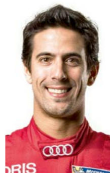
Lucas di Grassi

Date/place of birth: Aug 11, 1984/São Paulo (BR) Place of residence: Monaco (MC) Career highlights: 2005 1st Formula 3 Grand Prix Macau, 2010 F1 driver, 2012 3rd 6h São Paulo, 2013 3rd 24h Le Mans, 2014 2nd 24h Le Mans, 4th WEC, 2015 WEC